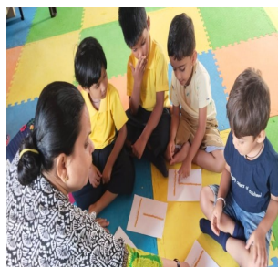
Nursery – Line Concept