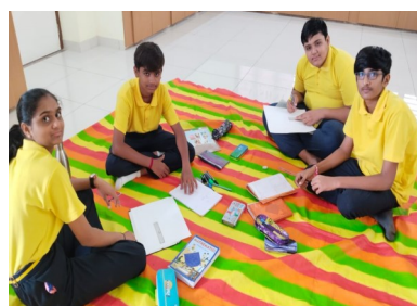
Class –9 Maths (Square root spiral)