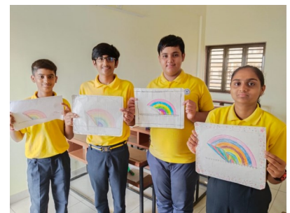
Class –9 Art Activity