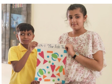
Class - 5 Maths (Fish Tale)