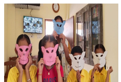
Class –3 Halves (Symmetry Line)