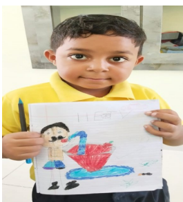
Class –2 Art Activity