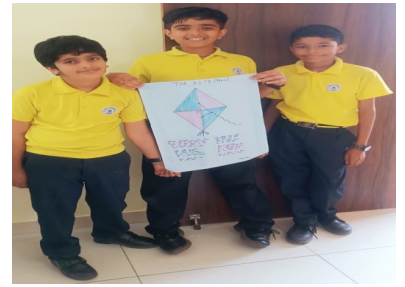
Class – 6 English Activity