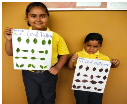
Class – 2 Maths Activity