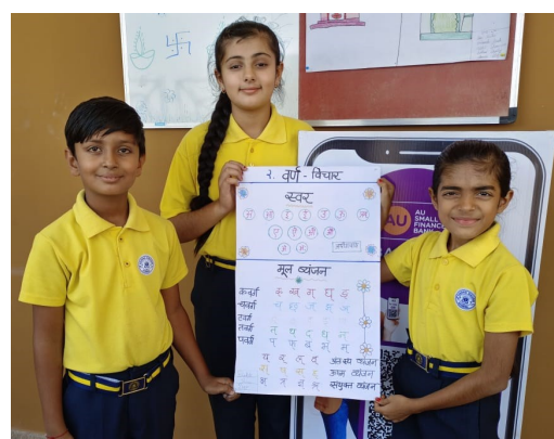
Class – 5 Hindi Activity