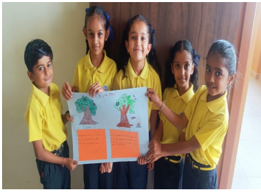
Class – 3 English Activity