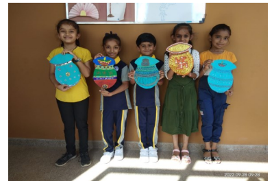
Class – 3 Art Activity