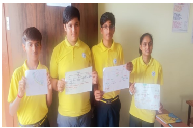
Class – 9 SST Activity