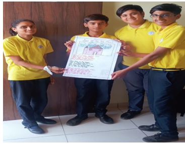
Class – 9 English Activity