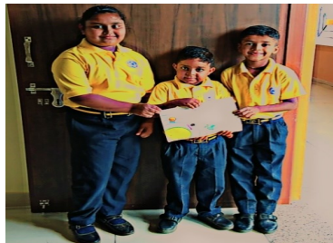
Class – 2 Art Activity