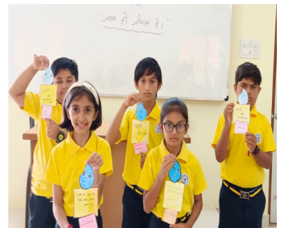
Class – 4 Hindi Activity