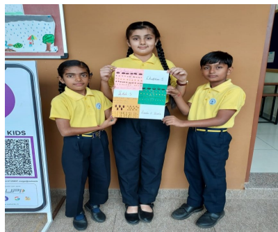
Class – 5 EVS Activity