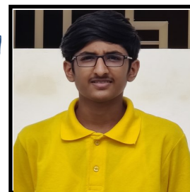
Gor Meet Class—9 Birthday—19/03/2008