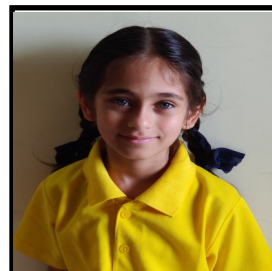
Thacker Heeva Class -1 Birthday—19/03/2016